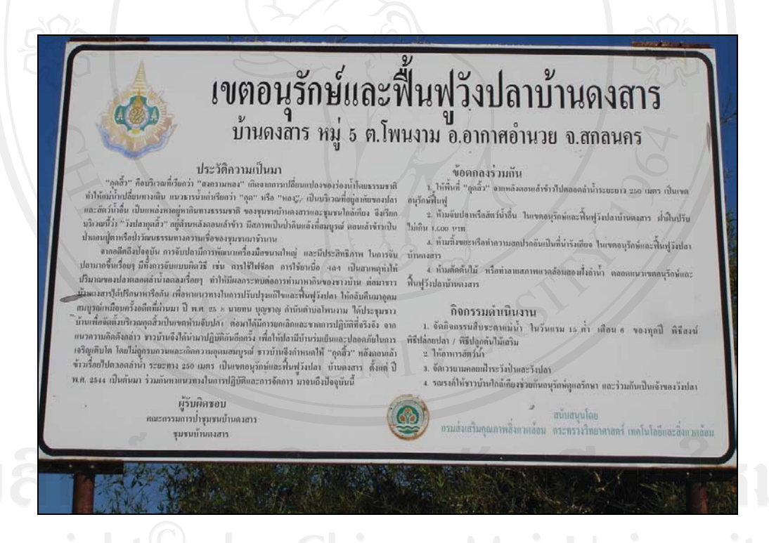
Figure 7-2: Fish conservation zones; the signs give notification of regulations.

membership fees, fishing permits, fish harvesting for community fishery management support, income from eco-tourism, service charges and fines from offenders. Within this management plan, therefore, there is an emphasis on both areas where the forest or fishery is strictly protected and flood forest and fishery utilization areas where extractive activities are permitted. For example, conservation strategies include protection of the flood forests near the village and protection of the fish sanctuary. For the flooded forest areas near the village, only dead wood can be collected, banning the cutting of green shoots for firewood.