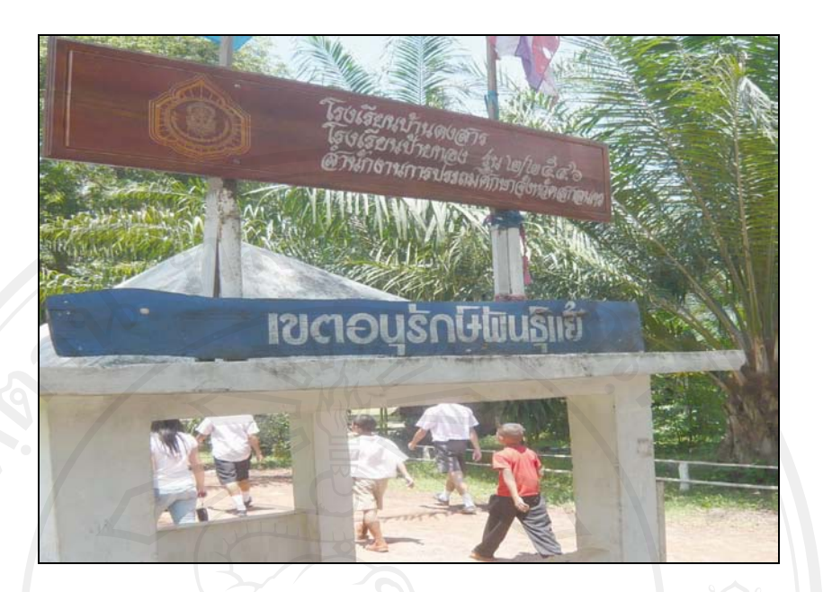
Figure 7-4: conservation area; eastern butterfly lizard at Dong San School.