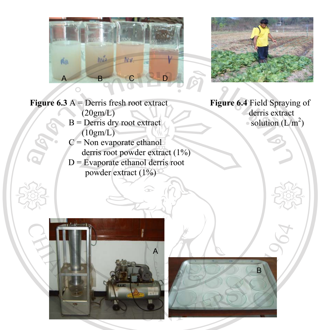
Figure 6.5 A = Topical tower sprayer (5 ml, 40 lb/inch<sup>2</sup>) B = Derris extract sprayed on dry plates (Petri dishes)