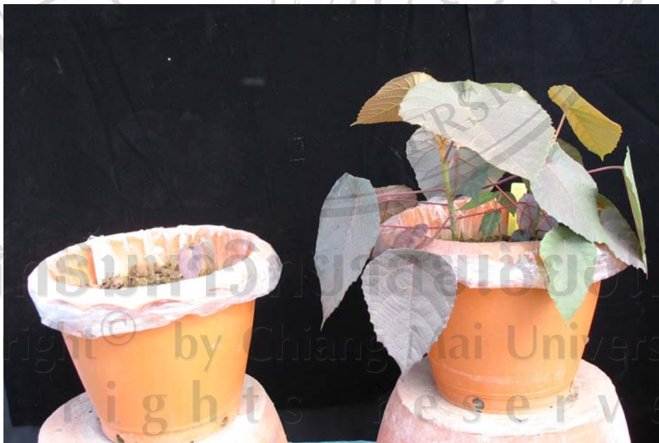
Figure 1.2 The response of Macaranga denticulata to AM fungi under pot conditions; without AM (left) and with AM fungi (right)

Plants associated with AM fungi generally have better nutritional status particular phosphorus and better growth than those that do not (Smith and Read, 1997). The benefits of AM fungi are well known, including enhanced uptake of water and soil nutrients such as N, K, Ca, Mg, Cu, Mn, Zn and especially P, a nutrient which is often depleted in rhizosphere soil solution (Marschner and Dell, 1994). The association between AM fungi and pada was studied by Youpensuk et al. (2003) who established it to be highly dependent on AM fungi as they strongly increased growth and nutrient contents especially when the soil phosphorus supply was limiting. Moreover, the AM fungi population in the farmer's field appears to be highly diverse, with 29 species in 6 genera being collected in one study (Youpensuk et al. , 2004).