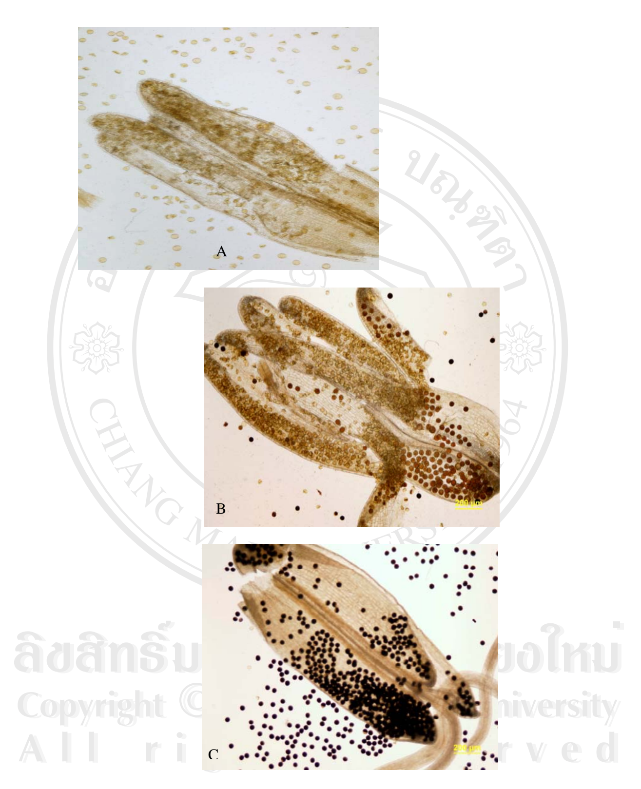
Figure 3.1 Pollen of F1 hybrid stained with I-IK solution: A) sterile pollen B) partially-fertile pollen C) fertile pollen.