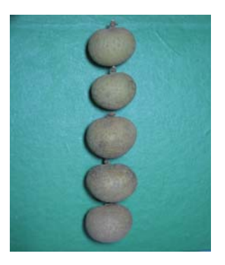
Figure 1 Browning scale of longan pericarp

Then browning indices were calculated using the following formula: Browning index = (browning scale x percentage of corresponding fruit within each class). Fruit having a browning index above 3.0 were rated as unacceptable (Jiang and Li, 2001).