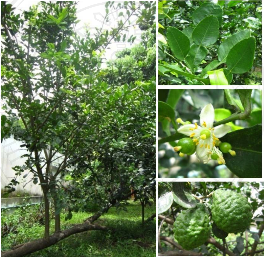
Figure 2 Kaffir lime tree, leaves, flowers, and fruits

leaves and rind have a perfume unlike any other citrus, which results from the combination of lemon/lime aroma (Figure 2).