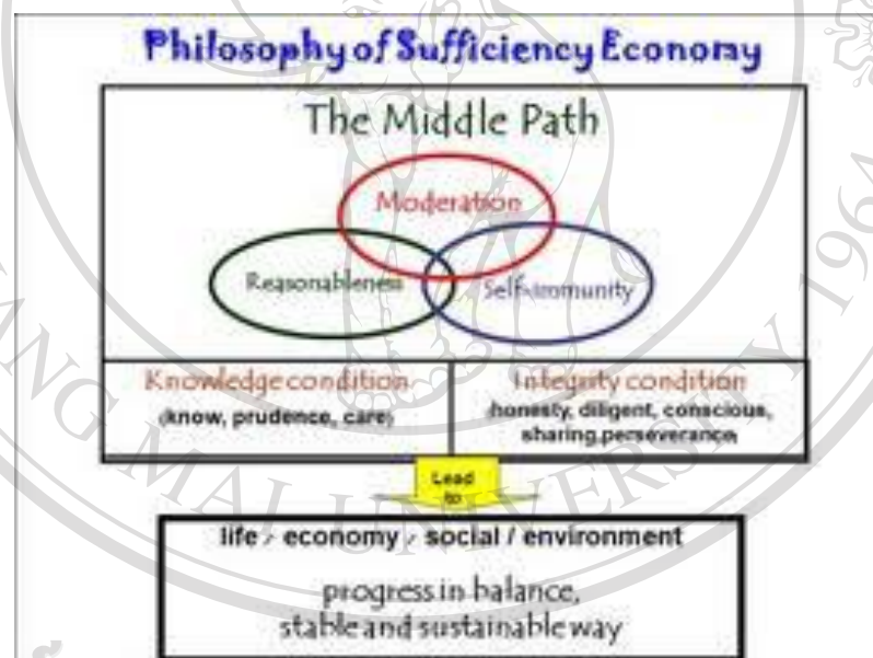
Figure 3: Sufficiency Economy Philosophy

Sufficiency have to have 3 attribute and 2 conditions as in figure 3.