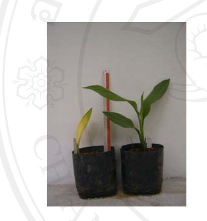
c) at 22 °C (left) vs 28 °C (right)