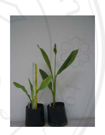
d) at 24 °C (left) vs 28 °C (right)