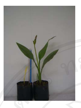
a) at 18 °C (left) vs 28 °C (right)