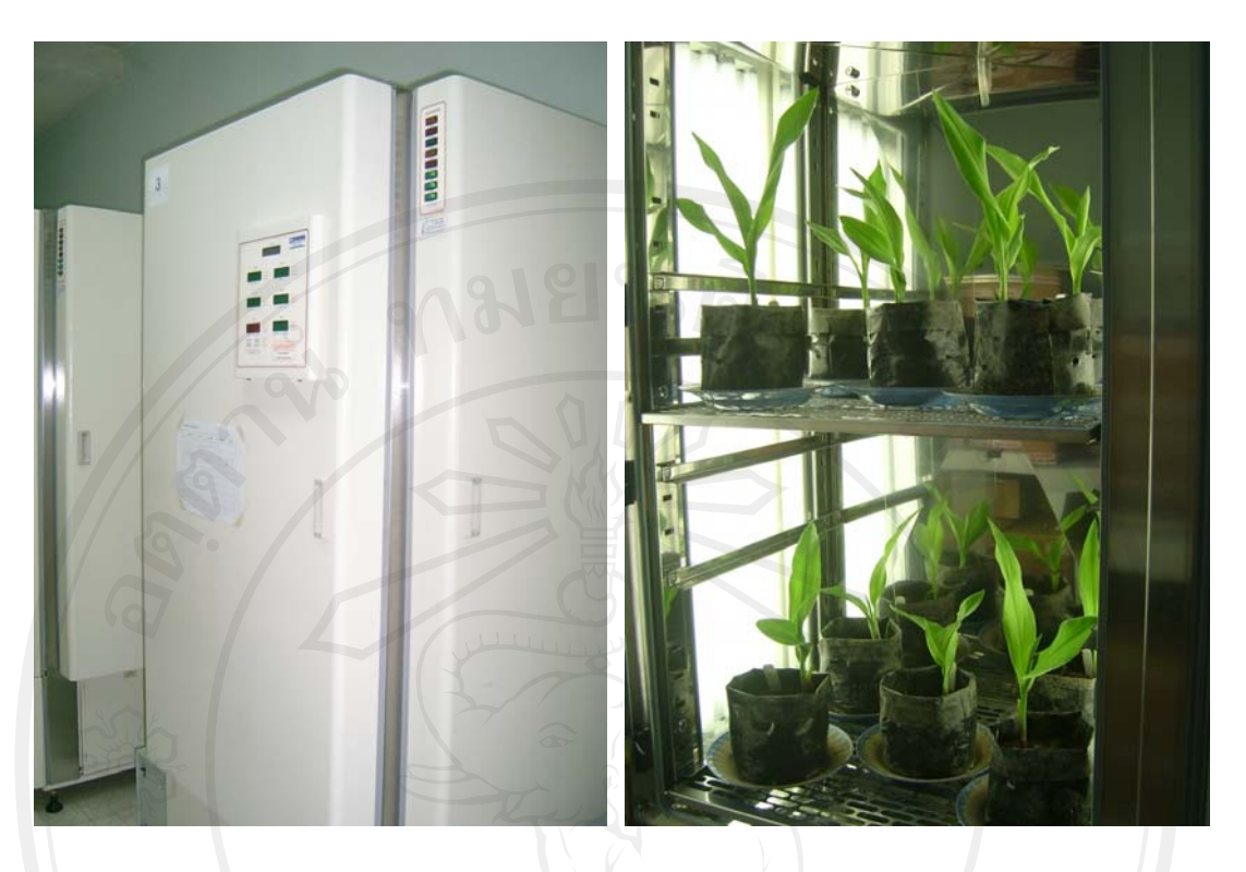
Figure 5.1 Plants grown in growth chamber under different constant temperatures.