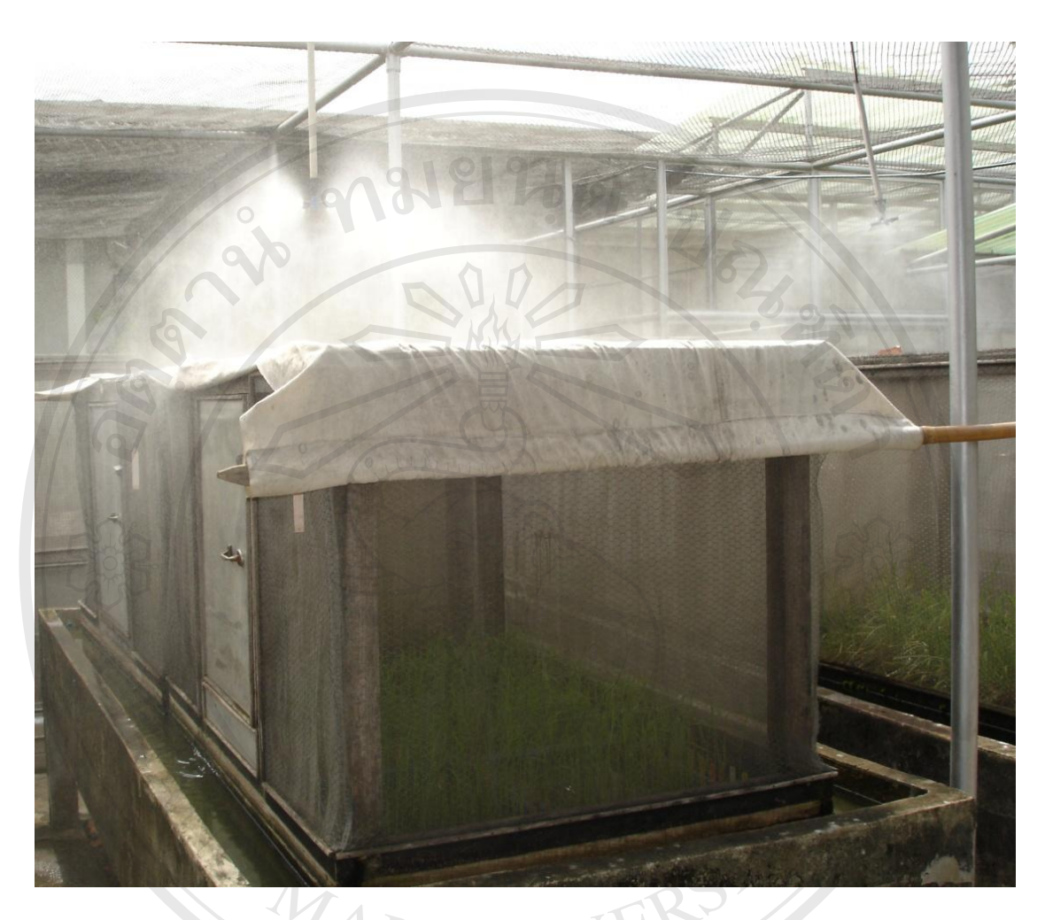
Figure 4.1 The twenty Muey Nawng accessions to gall midge in damage under green house condition.