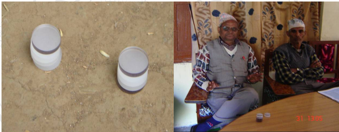
Figure 8.1 Estimation of decline in social capital dimensions during last thirty years