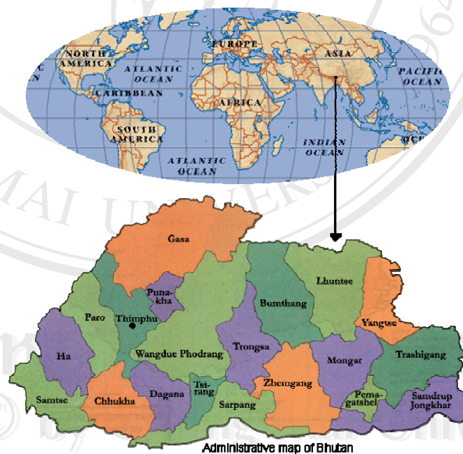
Figure 1. Location of Bhutan showing districts (Source: Jigten Tours and Treks, 2005).

The Kingdom of Bhutan is a small and landlocked eastern Himalayan country. It is located between latitudes of 26°45' N and 28°10' N and longitudes of 88°45' E and 92°10' E. It stretches 150 km from north to south and 300 km from west to east covering a total land area of 40,077 km 2 (MoA, 2002). Bhutan has common borders with only two but giant nations, China in the North and India in the East, West and South. Administratively, Bhutan is divided into 20 dzongkhags (districts) (Figure 1) and districts further sub-divided into 201 geogs (blocks equivalent to Tambons in Thailand).