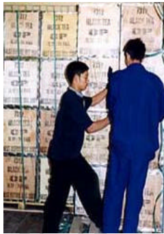
Photo 9 Tea packaging