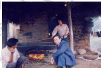
Photo 4 Visit tea grower