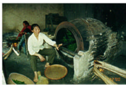
Photo 2 Tea processing in family