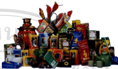
Photo 10 Tea products