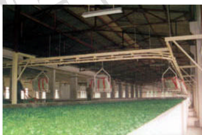
Photo 5 Tea manufacture