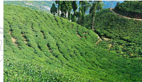
(b) in Thai Nguyen

ลิขสิทธิ์มหาวิทยาลัยเชียงใหม่ Copyright © by Chiang Mai University All rights reserved