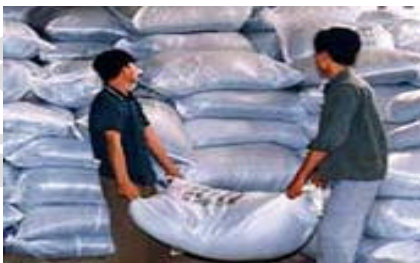
Photo 8 Tea packaging, storing