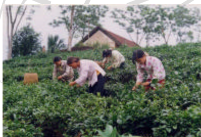
Photo 3 Tea plucking