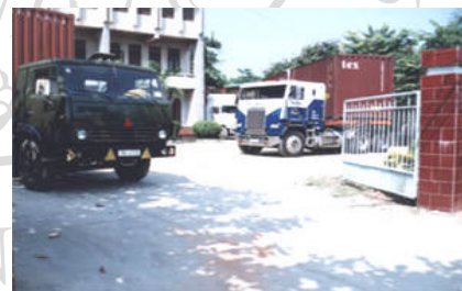
Photo 6 Tea transport