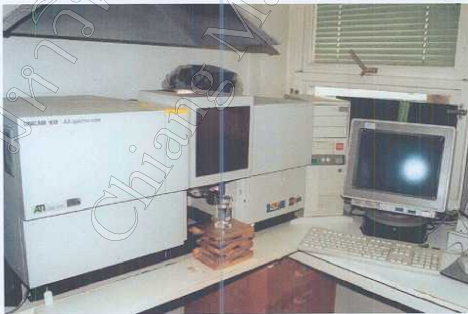
Figure 4 Atomic absorption spectrophotometer (Unicam 939) for analysis of Mg, Mn, Fe, and Zn