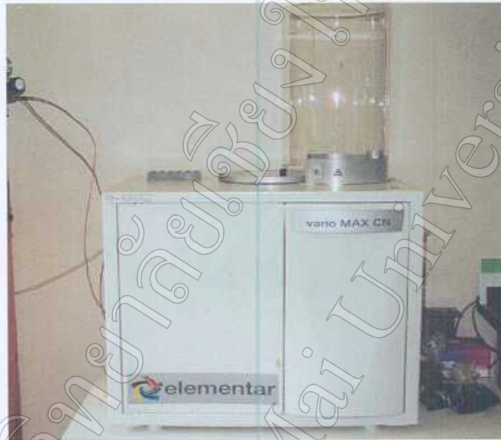
Figure 1 The analyzer (Vario Max CN) for analysis of N