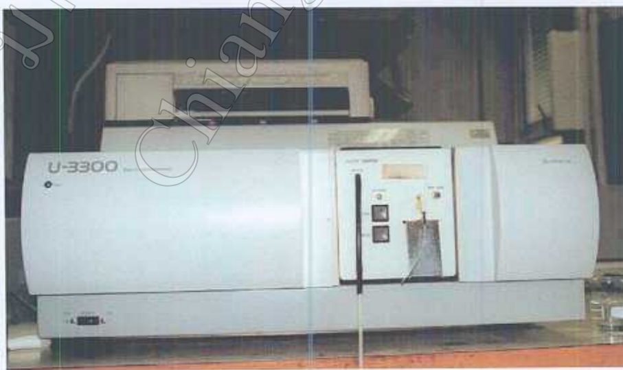
Figure 2 Spectrophotometer (Hitachi U-3300) for analysis of P