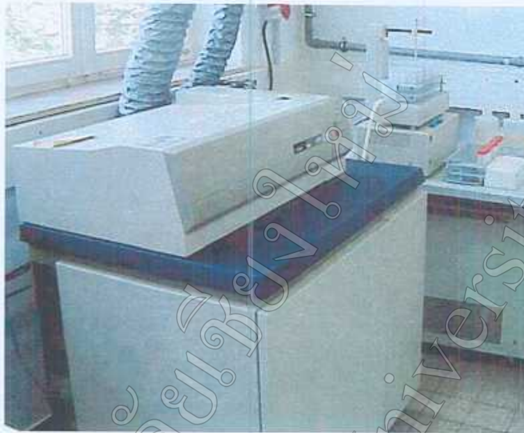
Figure 5 ICP-MS (ELAN 6000) for analysis of B

มหาวิทยาลัยเชียงใหม่ Chiang Mai University